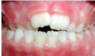
CROSSBITE OF BACK TEETH

Top teeth are to the inside of bottom teeth