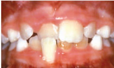
CROSSBITE OF FRONT TEETH

Malocclusions (“bad bites”) like those illustrated below, may benefit from early diagnosis and referral to an orthodontic specialist for a full evaluation.